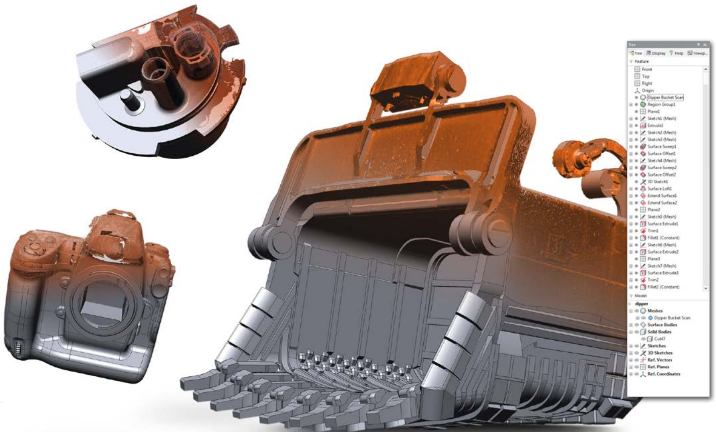
A parametric solid models created in Geomagic Design X

Save significant money and time when modeling as-built and as designed parts. Deform an existing CAD model to fit your 3d Scans. Reduce tool iteration costs by using actual part geometry to correct your CAD and elimination part springback problems. Reduce costly errors related to poor fit with other components.