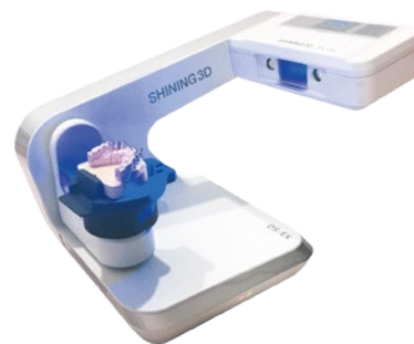
Black & White Texture