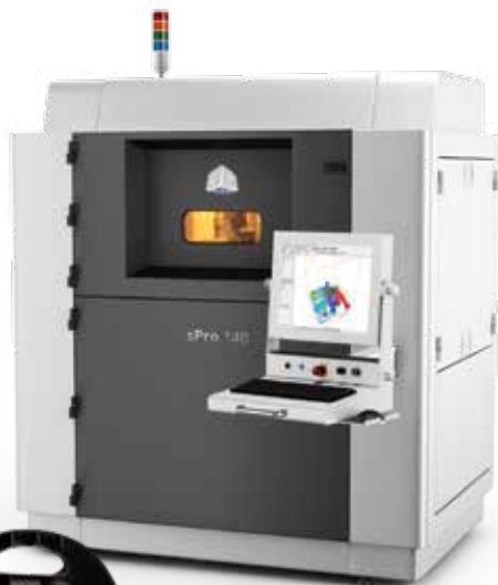
Back cover of vacuum cleaner printed in DuraForm EX Black