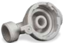
Hose fitting printed in DuraForm ProX GF