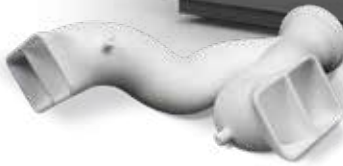
Manifold printed in DuraForm ProX FR1200