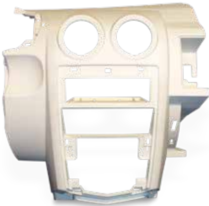
DuraForm PA Dashboard