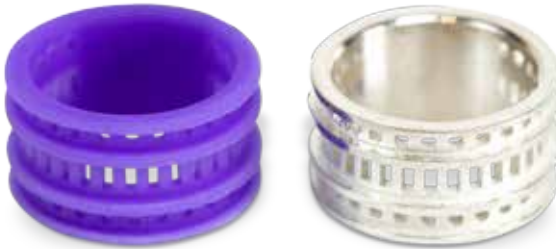
Ring printed in Visijet M2 CAST and cast

Warranty/Disclaimer: The performance characteristics of these products may vary according to product application, operating conditions, material combined with, or with end use. 3D Systems makes no warranties of any type, express or implied, including, but not limited to, the warranties of merchantability or fitness for a particular use.