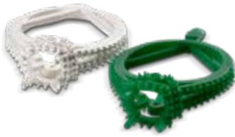
Figure 4 JCAST-GRN 10 is a green material, ideal for small, fine-featured jewelry master patterns for gypsum investment casting applications. This material leaves minimal ash after burnout to produce superior casting quality. Create and produce custom jewelry or other investment castings that capture fine detail with a smooth surface finish.