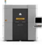
sPro 60 HD-HS