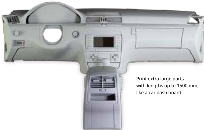
Print extra large parts with lengths up to 1500 mm, like a car dash board

3D Systems, the inventor of Stereolithography (SLA), brings you legendary precision in 3D printers, fine-tuned for cost-efficiency and unrivaled material availability. These advanced 3D printers produce exact plastic parts without the restrictions of CNC or injection molding. In addition to prototypes and end-use parts, these SLA printers create casting patterns, rapid tooling and fixtures. With speed, accuracy and surface quality of this level, you can produce low- to medium-run parts at a lower per-unit cost and build massive, highly-detailed pieces faster.