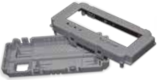
Electronic housing prototype printed in Accura Xtreme