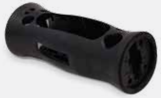
Toy prototype printed in Accura ABS Black

SLA printers are able to print highly detailed, tiny parts just a few mm in size, all the way up to 1.5 m long parts—all at the same exceptional resolution and accuracy. Even large parts remain highly accurate from end-to-end, with virtually no part shrinkage or warping.