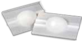
Microfluidic mixers printed in Visijet SL Flex