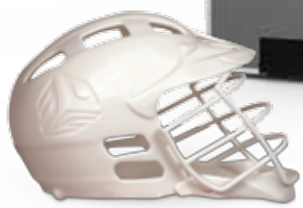
Helmet model printed in Accura Xtreme White 200