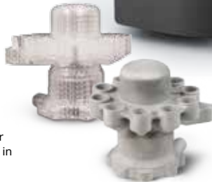
QuickCast® pattern in Visijet SL Clear, and aluminum casting